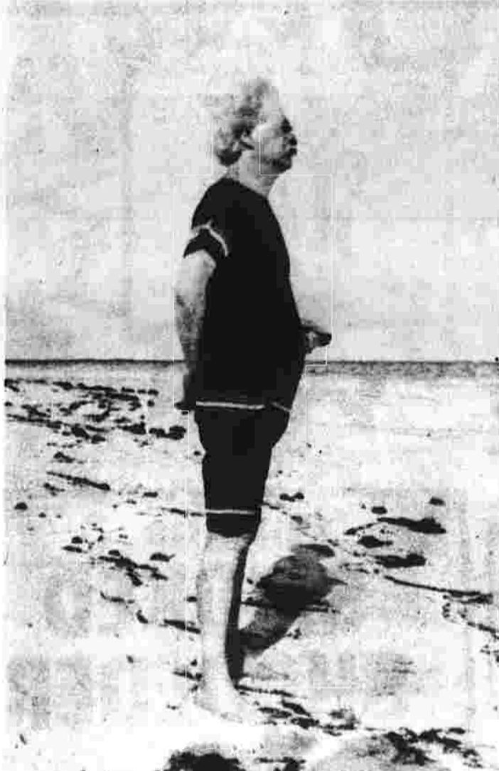
Mark Twain once said that "everybody talks about the weather, but nobody does anything about it." Apparently, he found a way to beat the heat, however. This photo was discovered last year and made public by the University of California's Bancroft Library in Berkeley. It was taken in 1908 when the famous writer and one-time Hartford resident was visiting in Bermuda.

Keeping the historic wall of separation between church and state in good repair is a difficult enough task. But what do we do when we are not sure what is church, or what is a bona fide religion? The other day federal agents raided offices of the Church of Scientology in Los Angeles and Washington, D.C., and carried away quantities of documents the government says were illegally taken from its extensive files on the group by covert Scientology agents.